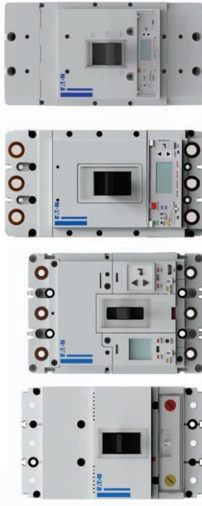
Power Defense™ molded case circuit breakers with Power Xpert® Release (PXR) electronic trip units.